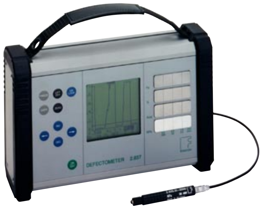
Eddy current test instrument DEFECTOMETER 2.837